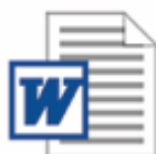
Microsoft Word (.docx)