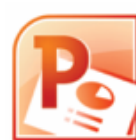
Microsoft PowerPoint (.ppt)