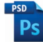
Adobe Photoshop (.psd)

Non-Vector artwork can be used In all Digital Processes and Embroidery.